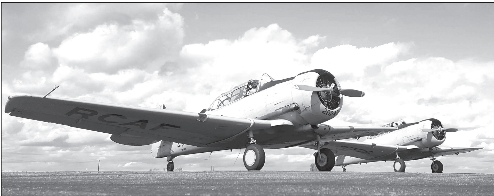
The Yellow Thunder two-plane formation aerobatics team will be performing this year as part of SkyFest weekend at Fairchild Air Force Base.